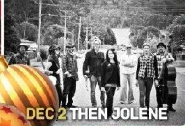
DEC 2 THEN JOLENE