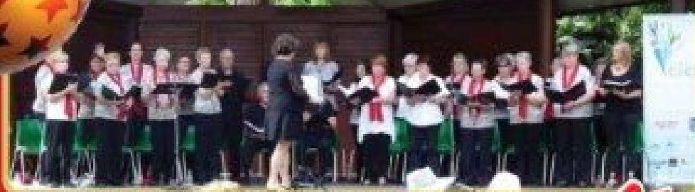
DEC 10 CAROLS UNDER THE BIG TOP